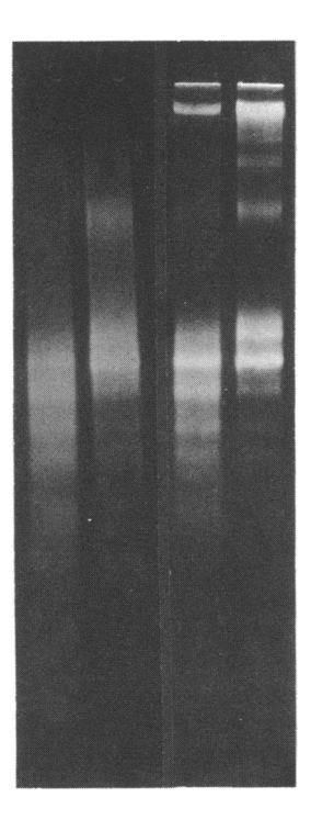
Figure 3. Polyacrylamide gel electrophoresis (6%) of DNA liberated upon digestion of metaphase chromosomes and interphase nuclei. Interphase nuclei and metaphase chromosomes were digested with staphylococcal nuclease. The resistant DNA was freed of protein and 10~\mu g applied to each slot of a 5% polyacrylamide gel. The gel was run as described previously, stained with ethidium bromide, and photographed. Samples from right to left represent 14 and 28% digestion of metaphase chromosomes and 10 and 30% digestion of nuclei

Attempts to assess the subunit structure of metaphase chromosomes require the preservation of this structure during the purification procedure and digestion. To test the possibility that rearrangement of chromosomal